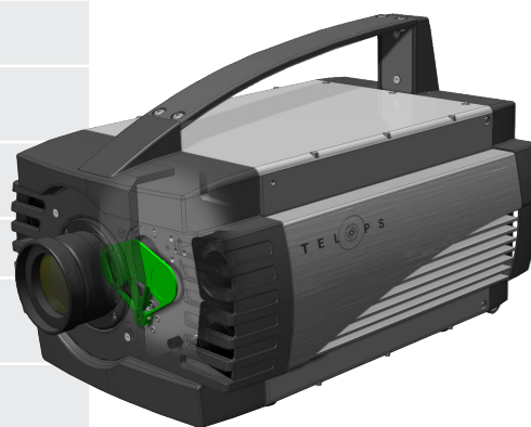
The automated 3-position filter mechanism.