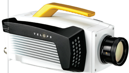
The IP-67 certified enclosure