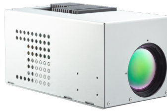
The R100 MC enclosure.