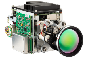
The R100 MC interior.