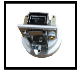
XPR MCP detector

MCPs are available as standalone pieces or complete detectors with mounting hardware. Our specialty XPR MCP detector is designed to perform in poor vacuum environments, making it an ideal choice for residual gas analysis and portable instrumentation. The MCP is encased in the stainless steel housing and is bakeable up to 300°F. This detector works in both Faraday mode and electron multiplication mode.